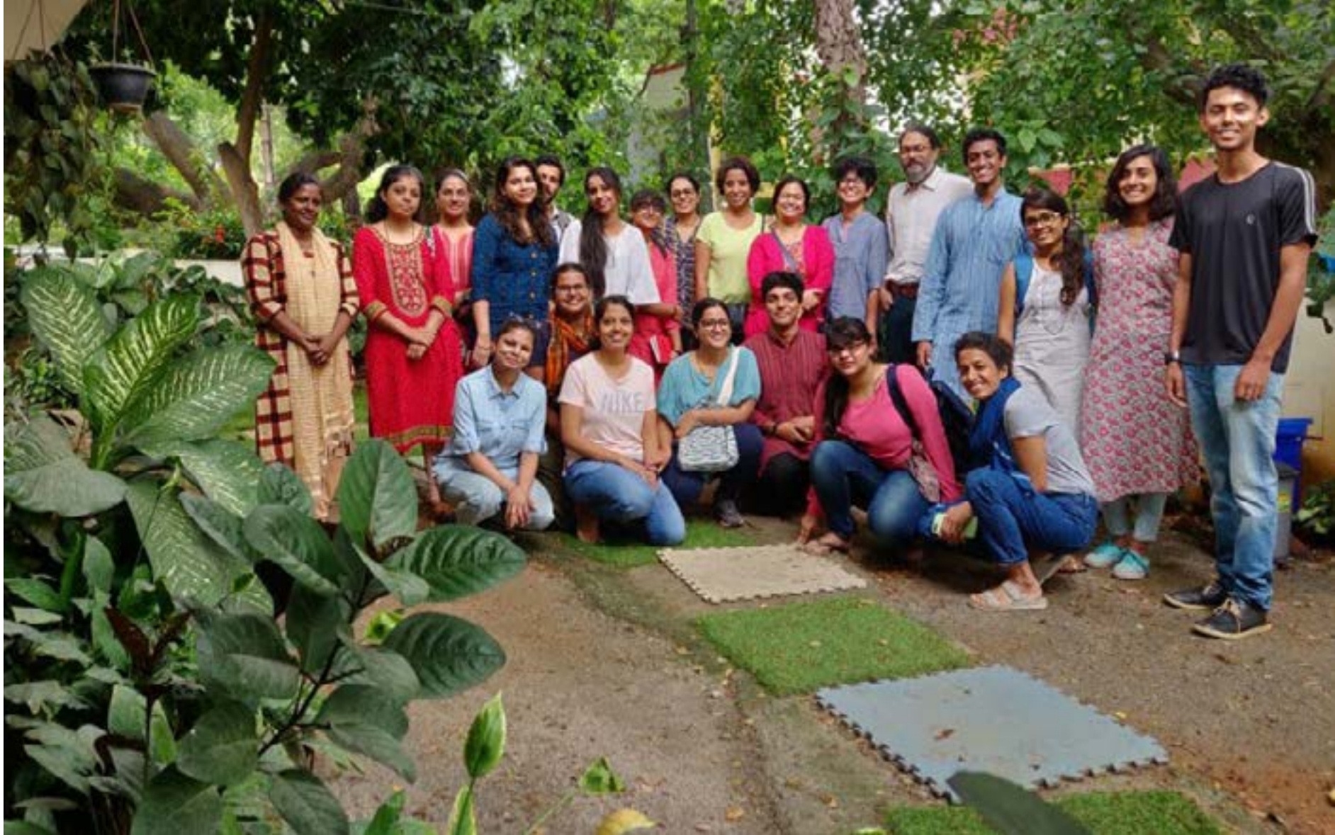
Srishti students visiting various Special Needs Centres in Bangalore