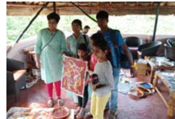
Srishti students conducting various art activities as a part of their research project at an event organized by Mitra for Life.