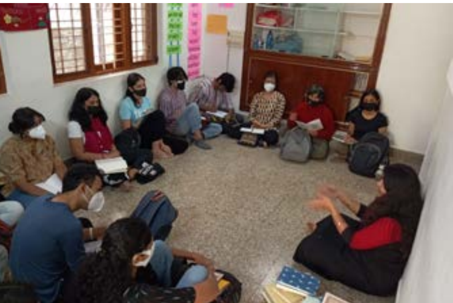
Srishti students visiting various Special Needs Centres in Bangalore